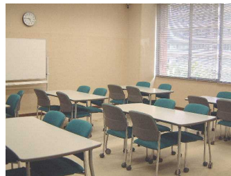
2F Seminar Room