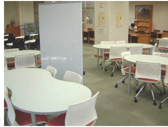
1F Free Study Room